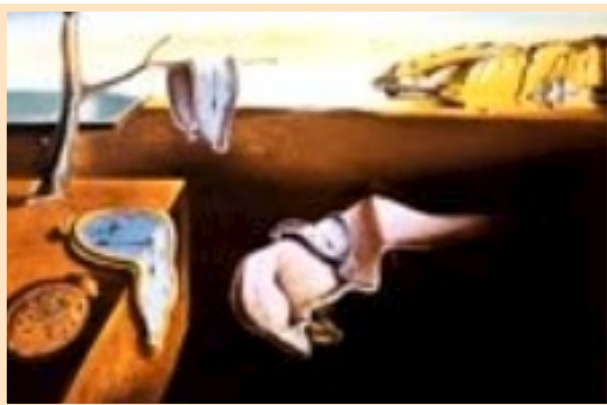
Salvador Dalí : Cloks